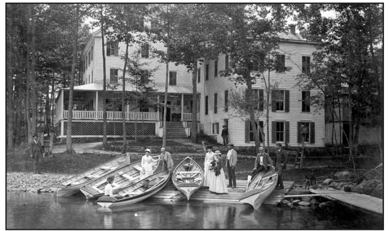
Whitehalls on Lake George.

American Lakes," she said. "Patrons of the great Lake George hotels used these boats between 1885 and 1926. One builder, F.R. Smith & Sons in Bolton Landing built over 600 of them."